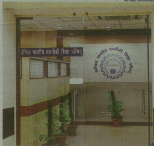
Closing the doors: AICTE said such courses were not in line with the UGC-approved programmes.

The five-year integrated course had an exit option at the end of three years with a degree